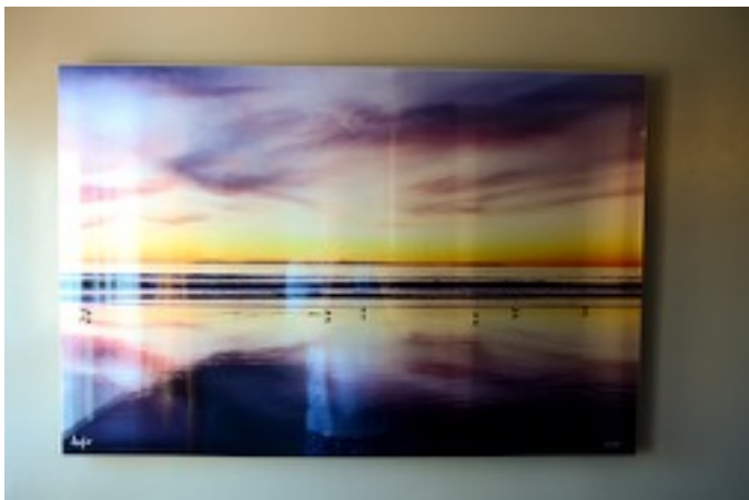
Brushed Aluminum Glossy Framed to edge