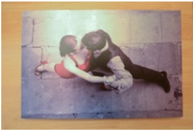
Aluminum Satin Finish Float frame inch float frame