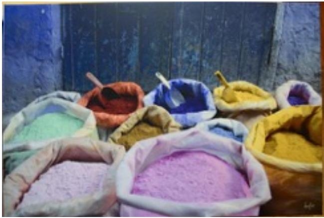
Canvas print with archival canvas and top clear coat